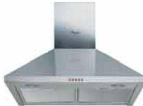
Whirlpool 60cm Hood AKR687