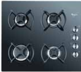
Whirlpool 60cm Gas on Glass Hob AKM403/NB

Easylife Kitchens offers you the choice of either the Whirlpool 60cm Gas on Glass Hob or the Whirlpool 60cm Electric Hob, together with a superb range of additional products which have been put together as the ideal combination for your kitchen, all for the unbeatable price of R12,500 incl. VAT