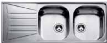
Teka Basico 2B 1D TE10124011