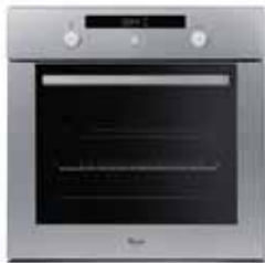
Whirlpool 60cm Eye Level Oven AKZ218/IX