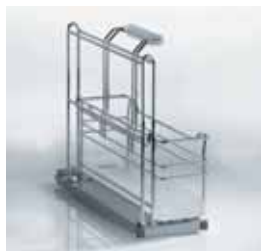
Kesseböhmer Portero Set 1 KS005151