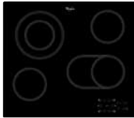
Whirlpool 60cm Electric Hob AKT821LX